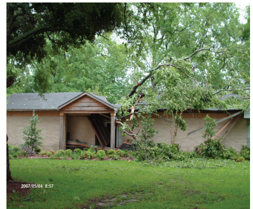
Sterlington Residence after the storm

On May 3rd at approximately 4:30 pm, Sterlington was rocked by a violent thunderstorm that packed high wind and torrential down pours of rain. Even though the storm passed quickly several residence received damage. Trees and utility poles were twisted and down. Several of our citizens experienced significant damage to the roofs and other property, and electricity was out in the town for several hours. While our citizens did report several injuries, most of which occur while making storm repairs, we are very happy to report that there were no casualties.